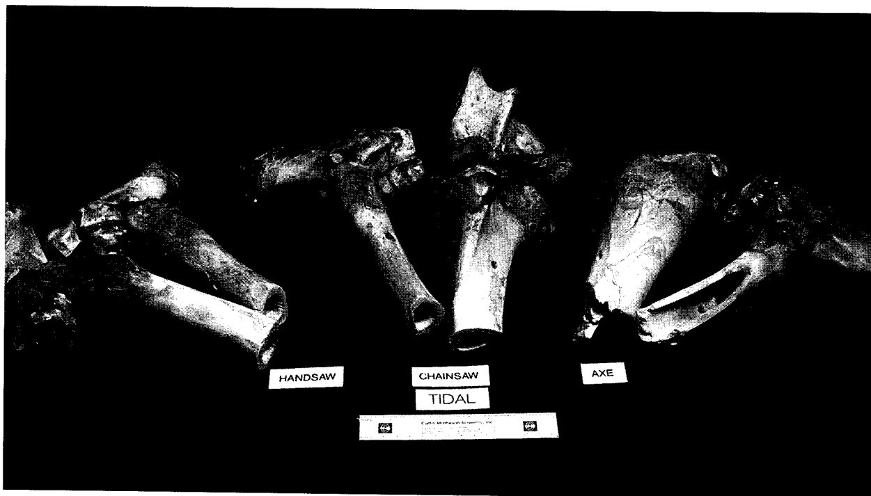
Fig. 4: Fresh, partly fleshed, articulated bones that had been exposed to a tidal environment with intermittent periods of submersion, wave activity and wind/sun drying retained residues of muscle, ligament and cartilage. The bones were still articulated and appeared oily, blotchy, and had blood stains.