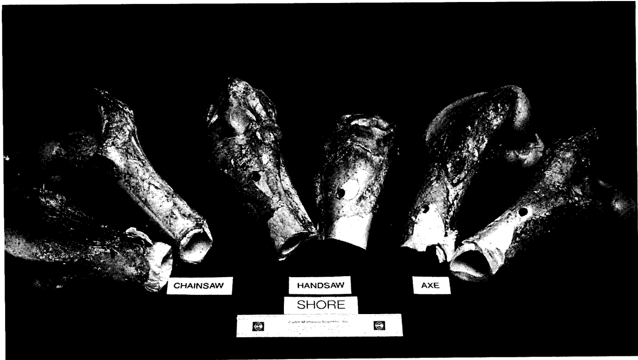
Fig. 5: Fresh, partly fleshed, articulated bones that had been exposed to a salt water beach environment retained residues of muscle, ligament and cartilage. The bones were still articulated and appeared very dry, white, with blood stains.

appear blood stained or oily, are consistent with having been exposed to the tidal zone or above the tidal area. These observable differences in such close micro-environmental zones are not surprising since Sutcliffe (1990) has described eight microclimate niches close to the water in the high arctic.