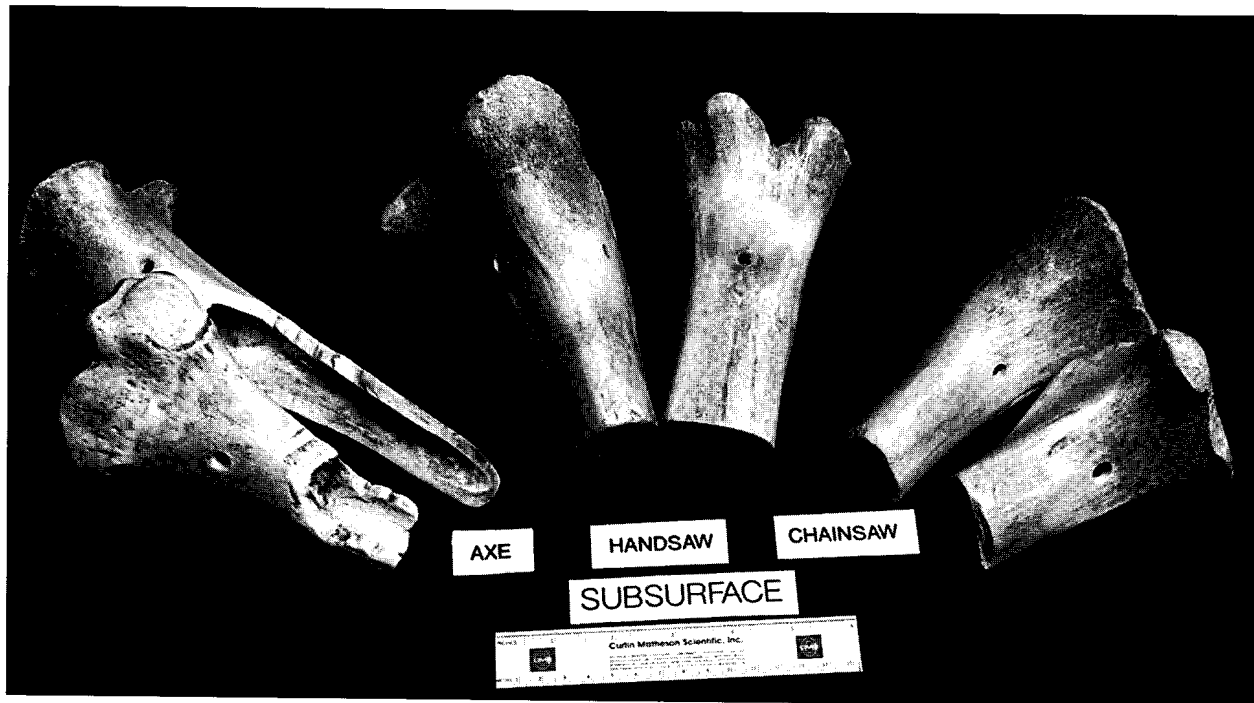
Fig. 3: Fresh, partly fleshed, articulated bones that had been exposed to a marine subsurface environment (submerged) were clean of muscle, ligament, cartilage and blood staining. The bones were disarticulated and appeared white and free of any visible organic film.